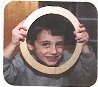
Make a Circle