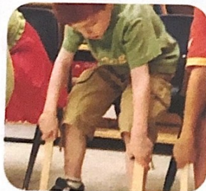
Touch My Toes