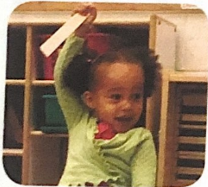
Up in the Air

Children use the Wood Pieces Set and music from the Get Set for School Sing Along CD to learn positions in space, body parts, and shapes.